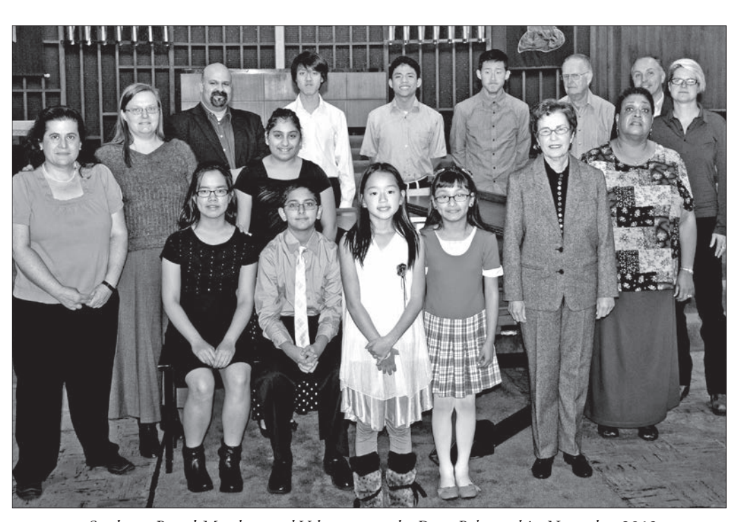
Students, Board Members and Volunteers at the Dress Rehearsal in November 2013.

Holiday Recital Saturday, Dec. 6, 2014 Reception to follow.